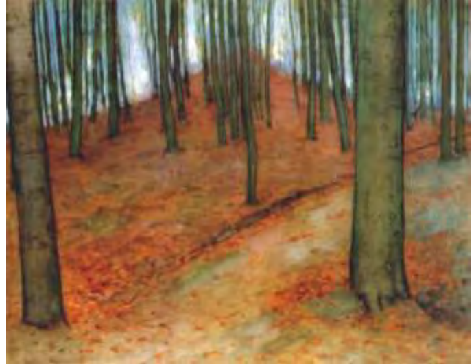
Figure 2: Piet Mondrian, Wood with Beech Trees , oil on canvas, 1889

directionality was already occurring: by comparison with Paul Cézanne's Chestnut Trees