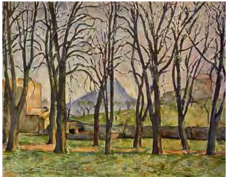
Figure 3: Paul Cézanne, Chestnut Trees at the Jas de Bouffan , oil on canvas, 1887, 73 x 92 cm